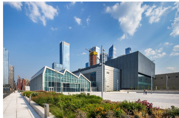
Image Credit: ©Albert Vecerka/Esto, adjacent to all reproduced and distributed material

Rooftop Event Space – A 15,000-square-foot pavilion on the new Javits Center rooftop can host events for up to 1,500 people. It was added as part of the convention center's $1.5 billion expansion, executed by a Lendlease and Turner joint venture.