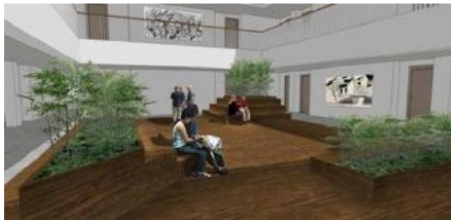
Artist impression of the indoor courtyard